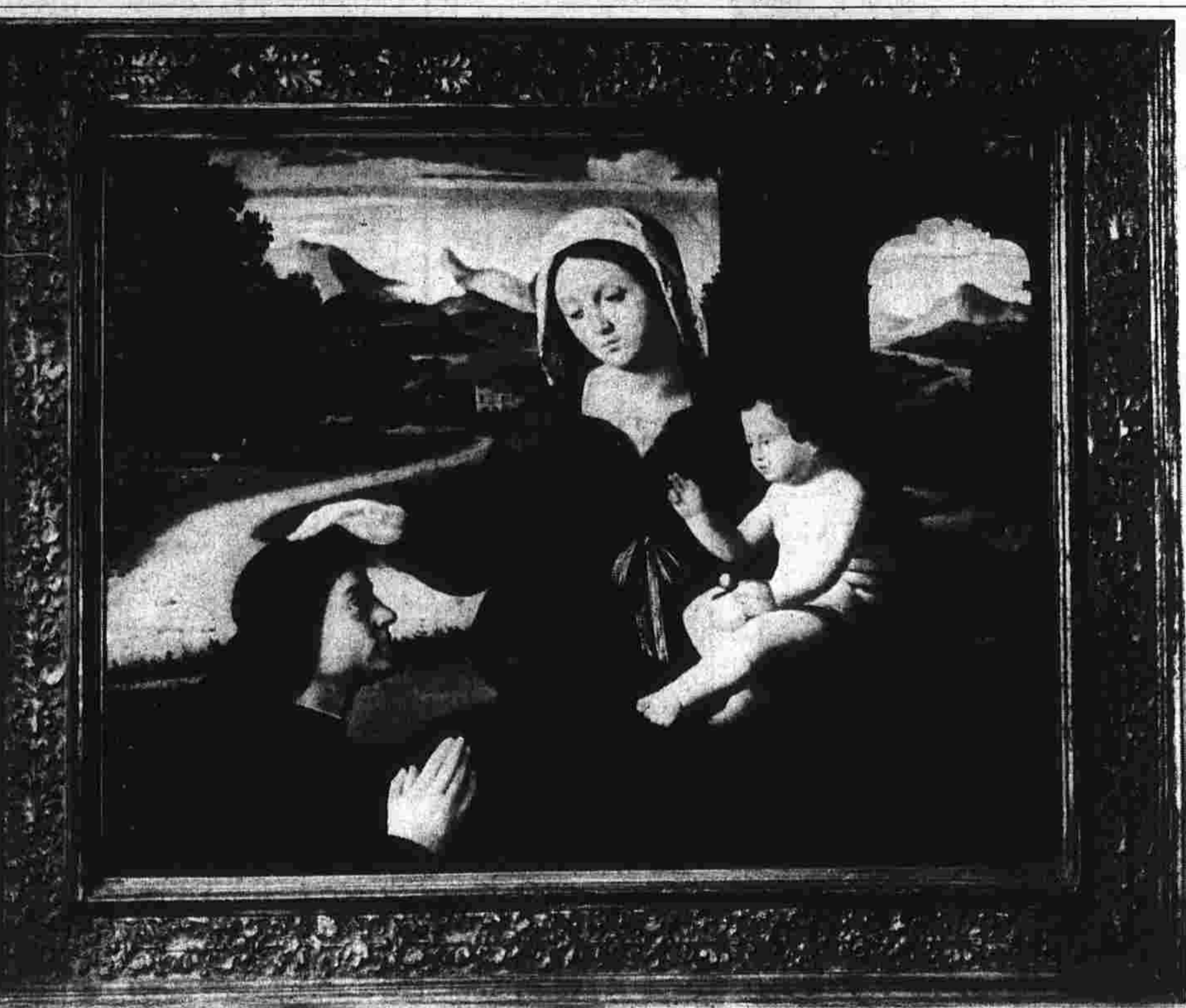
Drawn to the gentle sweetness of the Mother and Child, the young man finds what he was seeking. Yet he did not have to seek far—for nearby are the Alps north of his native Venice. Others have found the Mother and Child too, far from Bethlehem, in different ages, different places.

The train was traveling from Soverato-Mannelli to Catanzaro, a distance of 25 miles.